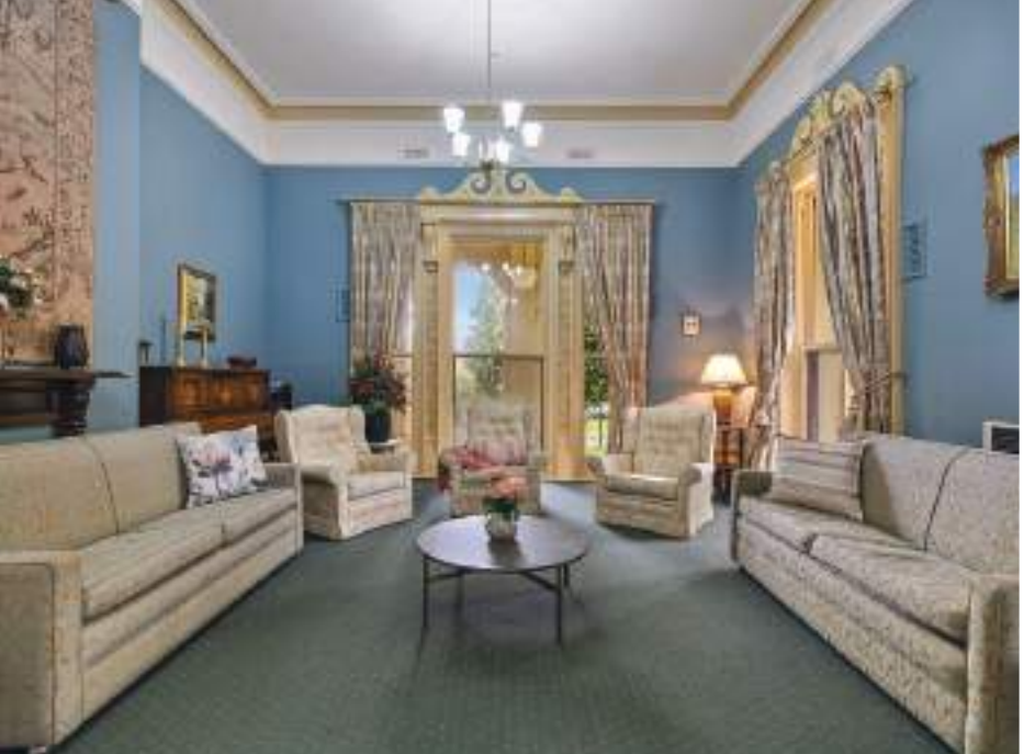
"Broughton Hall provides a home-like feeling, with a sense of family. A great sense of community, our residents relax, interact with each other with a sense of purpose"